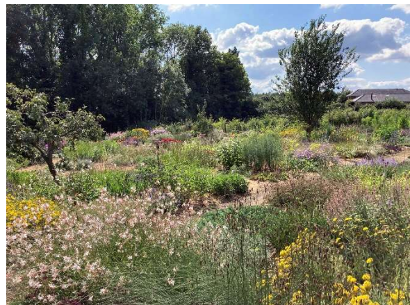
The plant library in July 2021 (left) and the plant library in September 2021 (right)