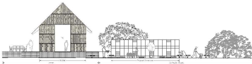
Greenhouse Elevation 2 Scale 1:100

The design of the nursery comprises a self-contained area enclosed by deer and rabbit fencing and sheltered both by the barn building and existing woodland and a mature hedge. It feels comfortably enclosed but not hemmed in. Within this area we propose to add a commercial glasshouse 80m 2 and a 32M 2 mess room with a toilet, storage shed, boiler